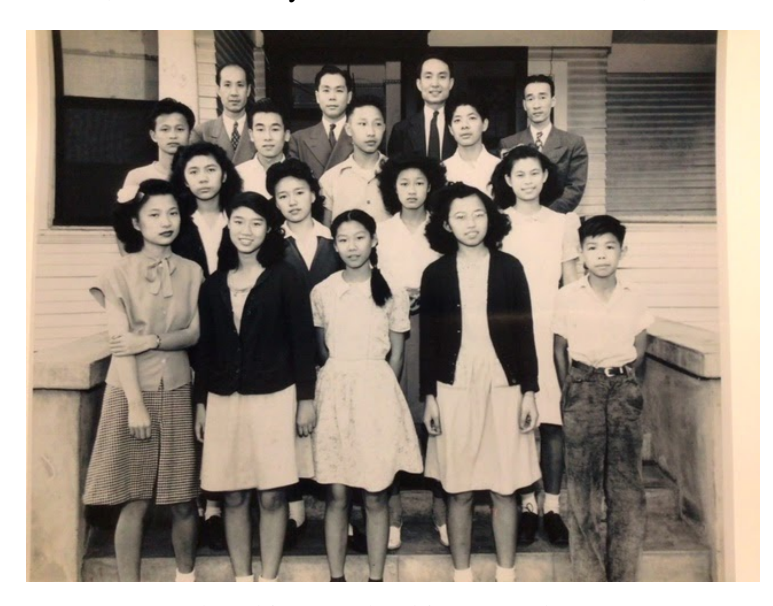
The Chinese School in East Adams.