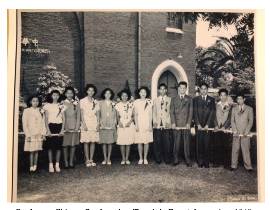
Graduates, Chinese Presbyterian Church in East Adams, circa 1940s.

Help Us Identify These Historical Photos from East Adams Do you recognize anyone in these photos?