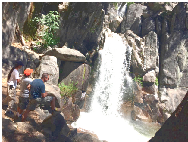
Above: Lower Chignualna Falls