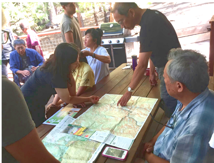
Above: Mapping out a hike on the 2019 trip