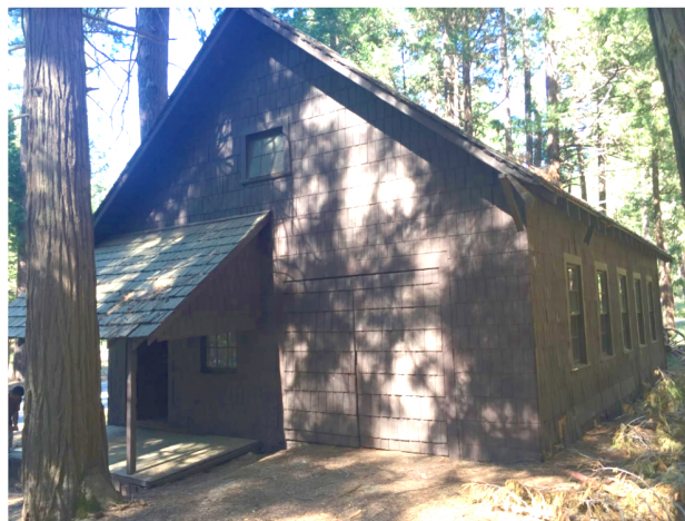
Right: The Chinese laundry building