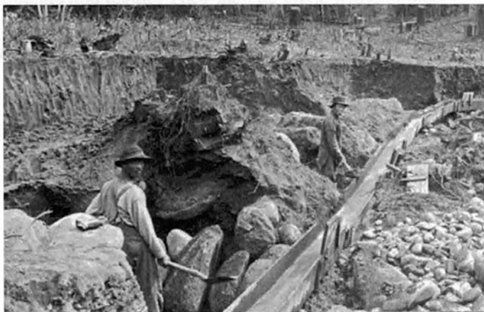
Chinese men washing for gold, 1880s.

The Vancouver Public Library, in partnership with Library and Archives Canada developed a wiki-based project that creates a portrait of the early Chinese-Canadian community. (A wiki is a page or collection of webpages designed to enable anyone who accesses it to contribute or modify content.) The project, "Chinese-Canadians: Profiles from a Community," was officially launched May 28, 2008. The goal is to collect and share individual stories of those who were born in Canada to parents of Chinese origin before 1901.