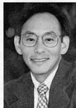
Steven Chu, Ph.D.

Dr. Steven Chu, 1997 Nobel Laureate in physics has been nominated for Secretary of Energy by President-elect Obama. Dr. Chu was born in the United States to highly educated immigrants from China. Currently he is the Director of Lawrence Berkeley Laboratory. He is profiled in PoP Book 2.