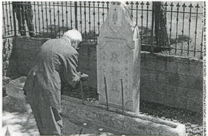
March 31, 2007 - Ching Ming Ceremony

CHSSC's commemoration of the springtime rite Ch'ing Ming or "pure brightness" (Chinese Memorial Day) was the most historically accurate and colorful event to date at the restored 1888 Chinese Memorial Shrine. About 80 people, including elected officials, attended the event in Evergreen Cemetery on the afternoon of March 31, 2007. This year marks the 10-year anniversary of restoration of the Shrine which the Society saved from demolition and continues to own and maintain.