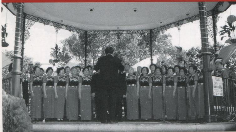
>> Southern California Senior Chorus at Lantern Festival 2003